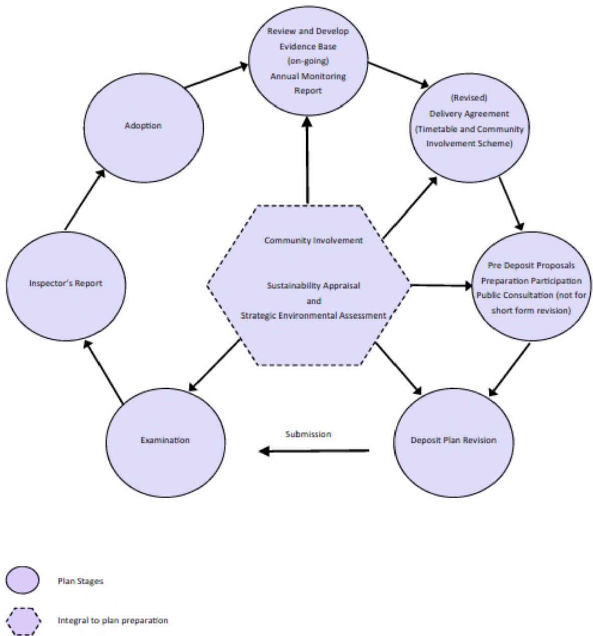
Figure 2 Local Development Plan Preparation Process Diagram

Replace Figure 2 with an alternative picture to provide a more up-to-date description of the Plan preparation process: